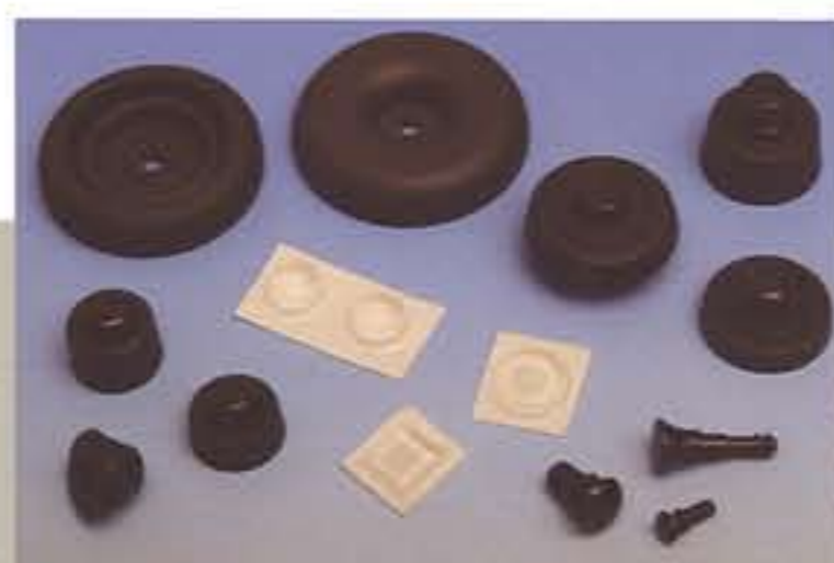
Rivets, Bumpers, and Feet