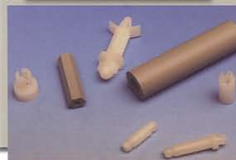
Spacers and Posts