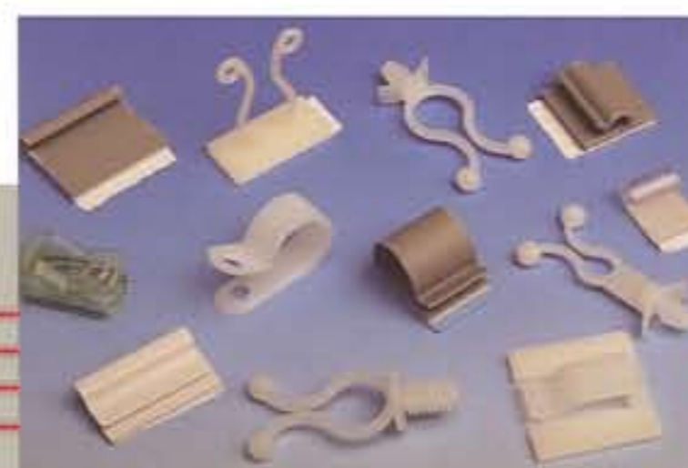
Clips and Clamps