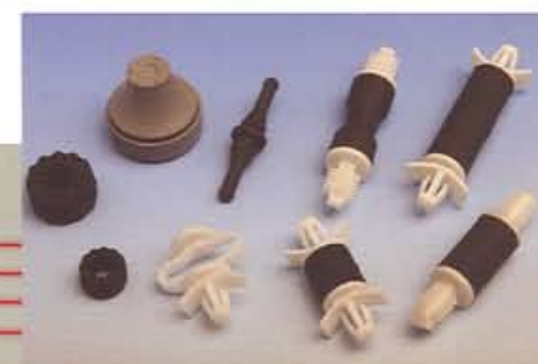
Shock and Vibration