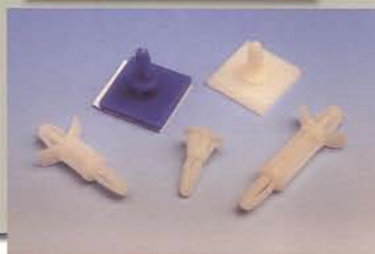
Circuit Board Supports