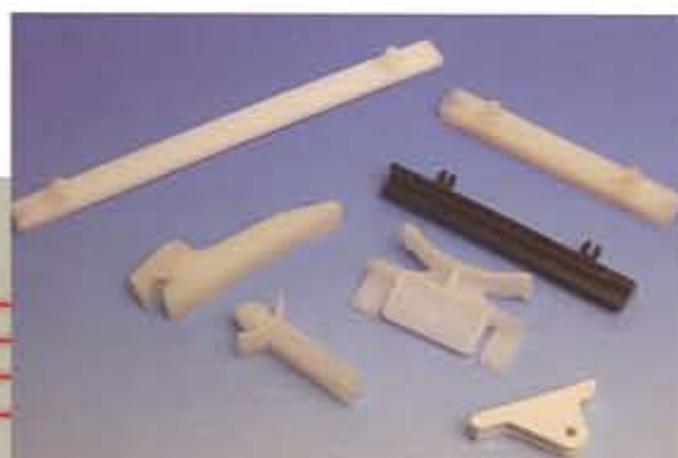
Card Guides and Pullers