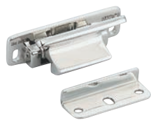
Lever Latches LL-66S