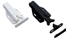
Non-Magnetic Latches MLC-100, MLCHT130BL