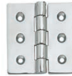
Stainless Steel Butt Hinges LSF, 28 Series, KHA