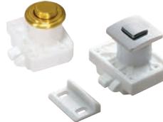
Push Knob Latches TLP, TLP-S