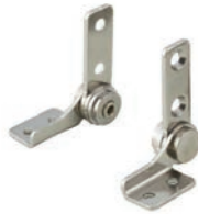
Stainless Steel Torque Hinges HG-TAS, HG-TBSJ, HG-TBS