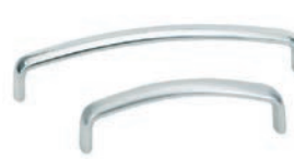
Handles EK-R, KC-R, KC-S