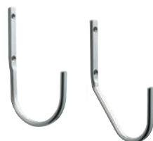
Large Utility Hooks JF-45, JF-70, JF-50, JF-80