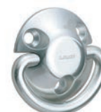
Folding Pad Eye (HD) EY-R