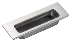
Recessed Pulls HH-KS, HH-DS, HH-K