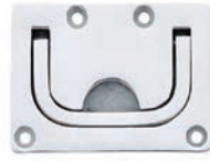
Folding Ring Pulls 26700, 26900, 26901