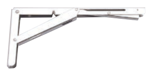
Folding Brackets EB Series, 388, BOS