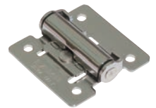
Stainless Steel Torque Hinges HG-TS, SFTH