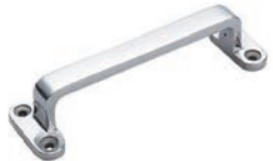
Handles FT-200, FT-280