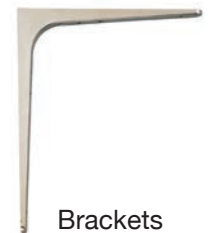
Brackets BT Series