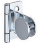
Glass Door Hinges GH-34/0/S-P, GH-34/8/S-P