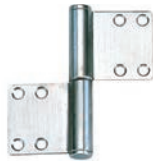
Lift-Off Hinges S-6173-2