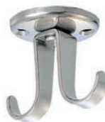
Swing/Rotating Hooks RF-50, UJ, JF-T