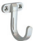
Utility Hooks KB-H, TA-3