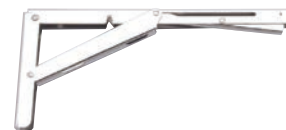
Stainless Steel Folding Brackets EB Series