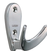
Fork Hooks EU Series