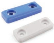
Sealed Mag. Catches MC-MSH, MC-JMF54