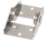
Torque Hinges HG-IT