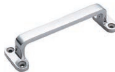
Handles FT Series