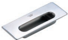
Recessed Pulls HH-KL160