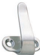
Large/Small Hooks 2H, JFT-180