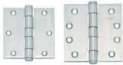
Butt Hinges 4040/SS