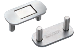
Stainless Steel Mag. Catches Back-mount Type MC-159-ST (Catch), MC-159U-ST (Counterplate)