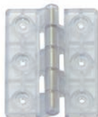
Butt Hinges HG-P100