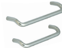
Offset Wire Pulls H-75-C Series