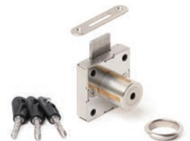
High Security Cabinet Cylinder Locks 7110-24-DN