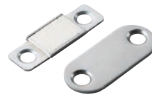
Ultra-Thin Magnetic Catches.