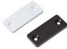
Ultra-Thin Mag. Catches MC-JM38