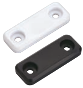
Sealed Mag. Catches MC-JM45 Mag. Force: 6.6 lbs