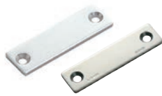
Stainless Steel Conterplates MC-JM49, AS-68