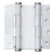
Double Action Spring Hinges JDAW Series