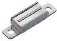
Stainless Steel Mag. Catches MC-YN05/MC-YN05-N Mag. Force: 6.6 ~ 16.5 lbs

Hermetically Sealed, No metal-to-metal contact.