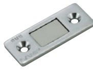
Stainless Steel Mag. Catches MC-149-SUS Mag. Force: 11 lbs