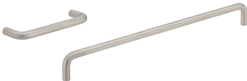
Wire Pulls SWP Series and SWF Series