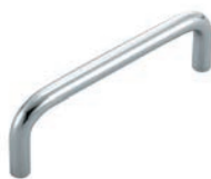
Wire Pulls H-42-C Series