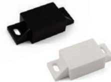
Sealed Mag. Catches MC-JM50