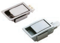
Flush Slam Latches LC-48, LC-65