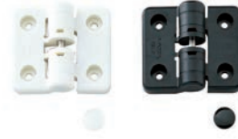
Detent Hinges HG-YJ50