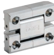
Tabletop Dual Torque Hinges HG-TMH