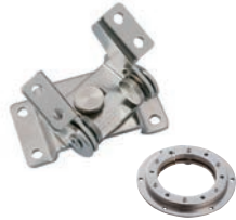
Swivel Torque Hinges HG-TS, HG-S Series