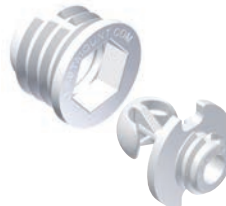
Fastmount® Standard Profile