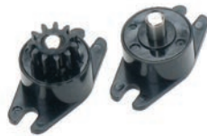
Rotary Dampers One/Two Way SRT-C2, SRN-C2