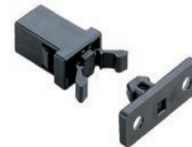
Non-Mag. Mini Touch Latches ESN-195-3.1, PR-4PK