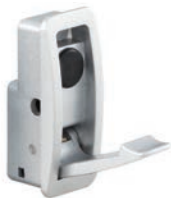
Recessed Hooks NF-60D