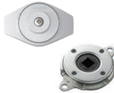
Disk Dampers UDD, SDT