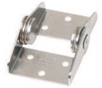
Torque Hinges HG-IT