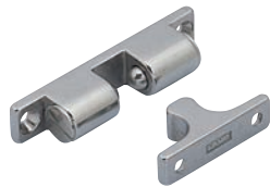
Tension Catches BCTS