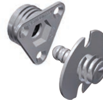
Fastmount® Metal Range Clips