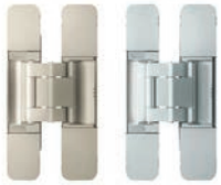
Concealed Hinges HES3D Series