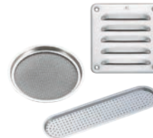
Stainless Steel Ventilators SAM, SAD, 1-1212, ASD