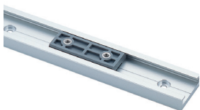
Glide Systems MRS Series