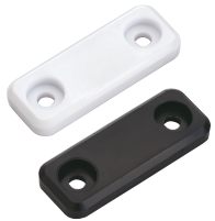
Sealed Magnetic Catches MC-JM45, MC-JM50