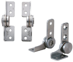
Torque Hinges HG-TA, HG-TB