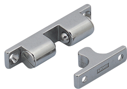
Tension Catches BCTS (Stainless Steel), BCT, BCU, BCTS-85J (Adjustable)