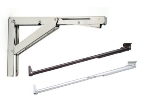
Folding Brackets EB-303, 388 Series