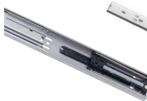
Full Ext. Stainless Steel Soft-Close Slides ESR-SC4513