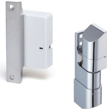
Soft-Close Hinges HG-JV65-U (Concealed), HG-JG150 (Gravity)