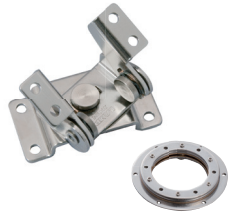
Dual Axis & Swivel Torque Hinges HG-TS, HG-S Series