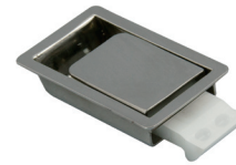
Slam Latches (Flush) LC-48, LC-65A