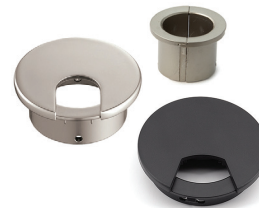
Lids & Grommets LS60F, CHC-S, LS-50S-S