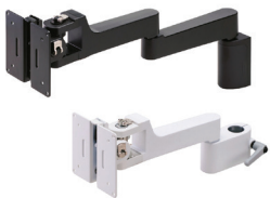
Monitor Arms KA-T100S50 Series