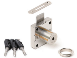
High Security Cabinet Cylinder Locks 7110-24-DN