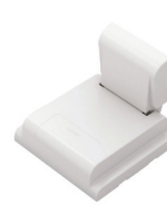
Lift-Assist Hinges HG-PA Series