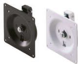
Rotation Brackets KA-T100S50-PMT