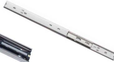
Full Ext. Stainless Steel Mini Slides SCR3 Series