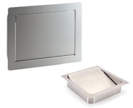
Multi-Purpose Chutes AZ-GD310, AD-KH028-HL