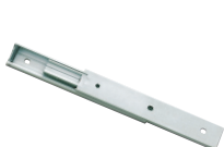
Aluminum Mini Slides AR3-16