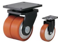
High Durability Urethane Wheels