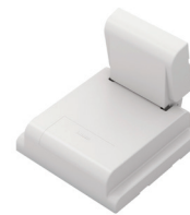
Power Assist Hinges HG-PA Series