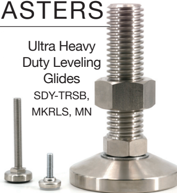
Ultra Heavy Duty Leveling Glides SDY-TRSB, MKRLS, MN