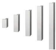
Extruded Aluminium Handles ALH