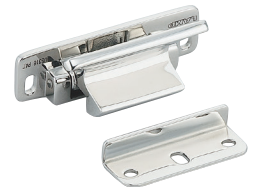
Stainless Steel Lever Latches LL-66S