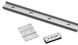
Multi-Roller Linears MLG20, MLG-20C, MLG-20-P55-40