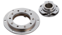
Swivel Torque Hinges HG-S Series