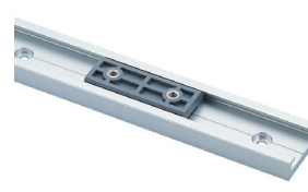
Glide Systems MRS Series