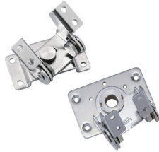
Dual Axis Torque Hinges HG-T30S15, HG-T70S30