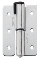
Lift-Off Torque Hinges HG-KNT