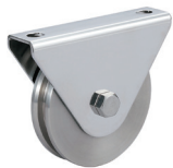
Bearing Rollers (HD) JS300